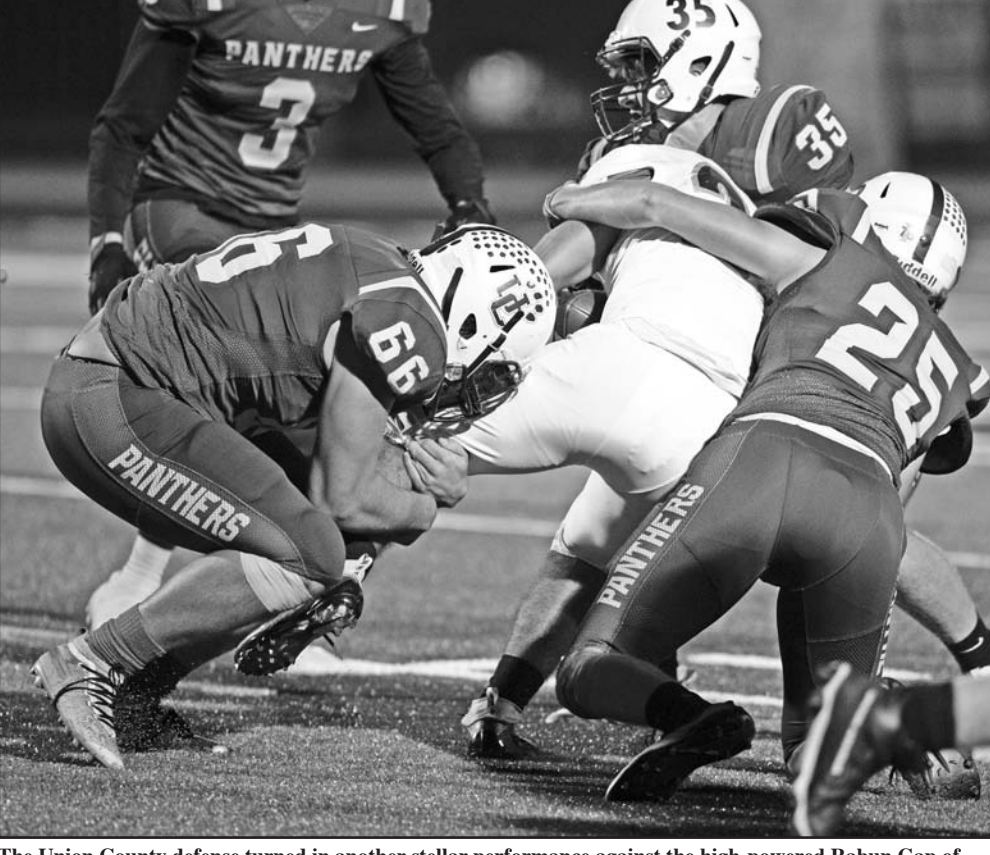
The Union County defense turned in another stellar performance against the high-powered Rabun Gap of fense, holding the Eagles to a season-low 21 points.